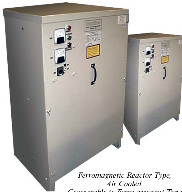
Ferromagnetic Reactor Type, Air Cooled, Comparable to Ferro-resonant Type