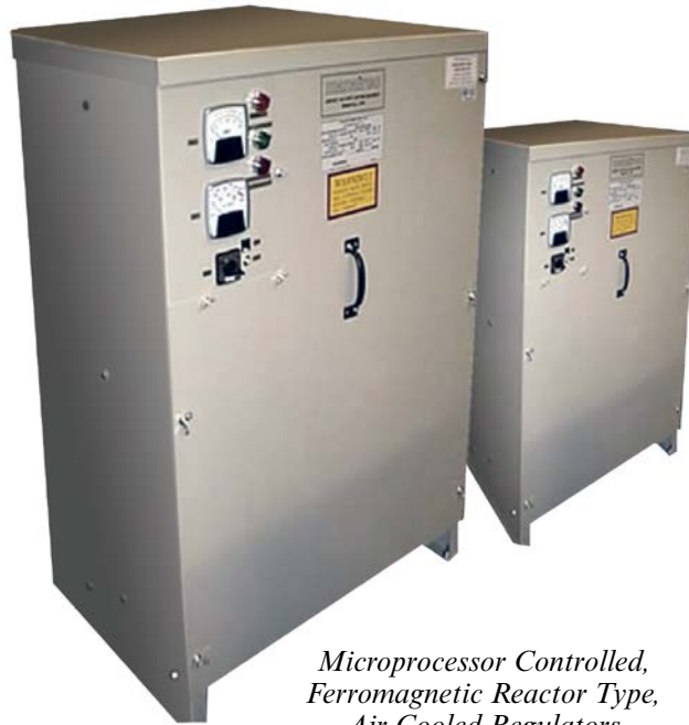
Microprocessor Controlled, Ferromagnetic Reactor Type, Air Cooled Regulators