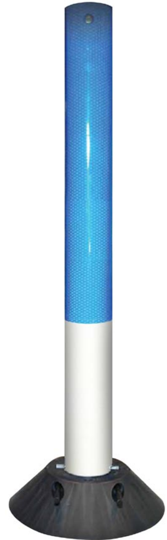
L-853 Retroreflective Marker Part Number: 76-853-SMA18WB