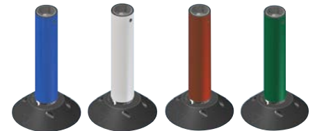
Available colors: Reflective: Blue, Silver, Red, Green. Tube: White, Light Gray, Dark Gray.