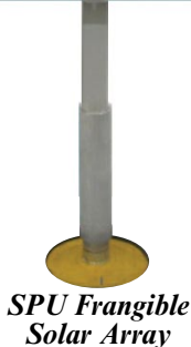
SPU Frangible Solar Array