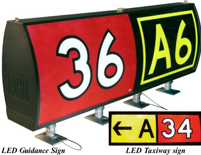
LED Guidance Sign