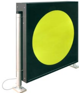
Arresting Gear Marker