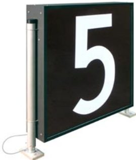
Distance Remaining Marker