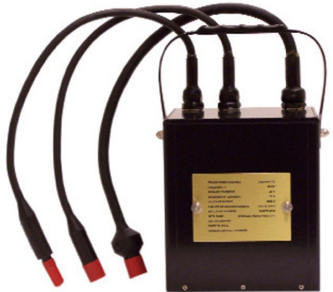
Part Number TR-TT116-1