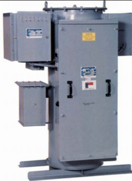
10KW-70KW Oil-Filled Regulator